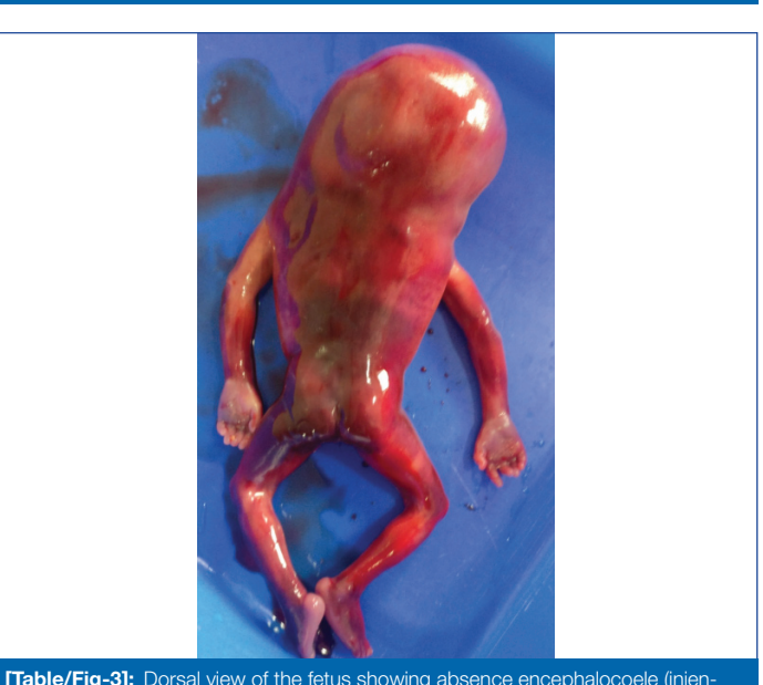
[Table/Fig-3]: Dorsal view of the fetus showing absence encephalocoele (inien-