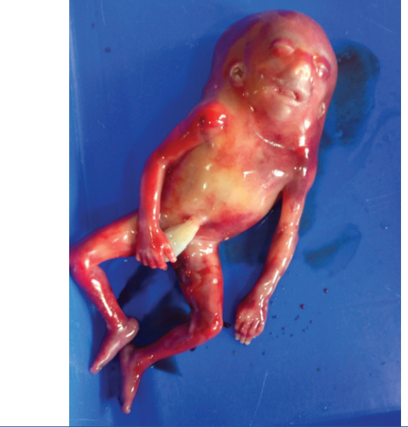
[Table/Fig-2]: Ventral view of the fetus showing cervical shortening with hyperexension of the neck and continuation of mandibular skin to the chest wall.

A 23-year-old primigravida presented to the OPD for routine antenatal booking at 16 weeks. Her previous antenatal visits were with a nearby health centre. There was no first trimester screening. All her antenatal blood investigations were within normal limits. An anomaly scan was carried out at 19 weeks. It showed a single live intrauterine fetus with gestational age corresponding to 19 weeks 1 day with subcutaneous oedema of the scalp and neck with an abnormal nuchal fold thickness of 8.5 mm. The fetal calvarium was normal but cerebellum was not visualised. There was abnormal retroflexion of neck with abnormal shortened spine with absent cervical spine, dilated lateral ventricles, abnormal posterior cranial fossa and a small thorax. Dorsal and lumbar spine were normal. No obvious spinal dysraphism was noted. All the features represented Iniencephaly [Table/Fig-1]. A second opinion from another fetal medicine specialist was sought and the diagnosis was confirmed. Patient was counselled regarding the poor prognosis and so she went ahead with medical termination of pregnancy. A dead female fetus of weight 300 g with fixed retroflexion of the head, without a neck, and with low-set ears was found. There was no lumbar meningocele [Table/Fig-2,3]. Since, the family did not accept autopsy, further evaluation for the presence of additional anomalies was impossible.