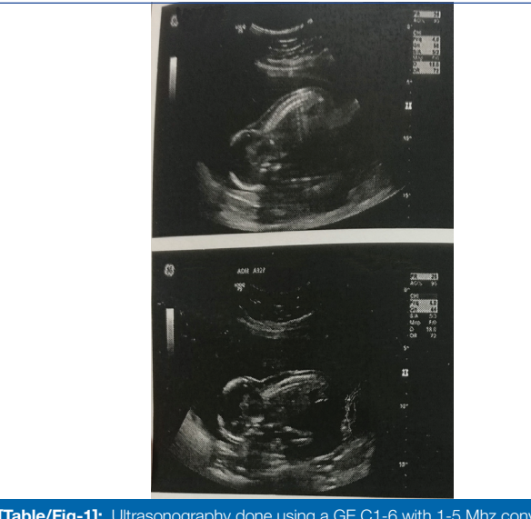
[Table/Fig-1]: Ultrasonography done using a GE C1-6 with 1-5 Mhz convex probe hortened spine (abnormal cervical spine) with increased nuchal fold thickening